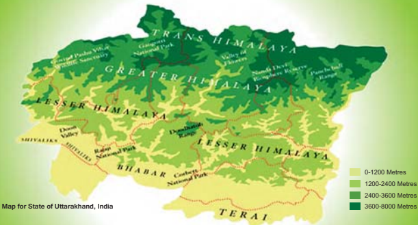
Map for State of Uttarakhand, India