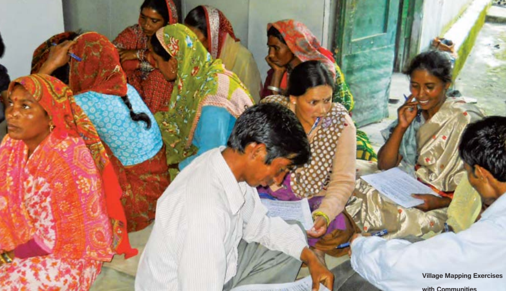
Village Mapping Exercises with Communities