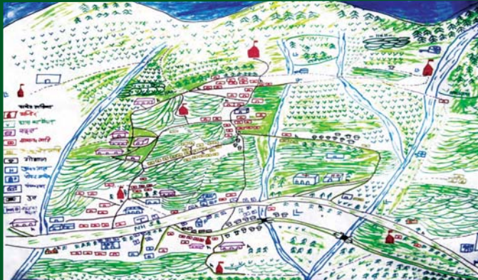
Village Map = AAGAAS